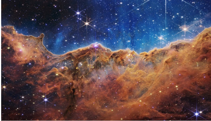
The Carina Nebula