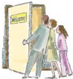
New Member Class

For anyone interested in learning about church membership, come be introduced to the mission, vision, staff and ministries of Maple Grove. We will share about our faith journeys and discern how God is calling each of us to serve in and through Maple Grove. New members can take membership vows at either worship service on Sunday, November 20 . Everyone is welcome to attend, even if you are not sure you want to become a member at this time.