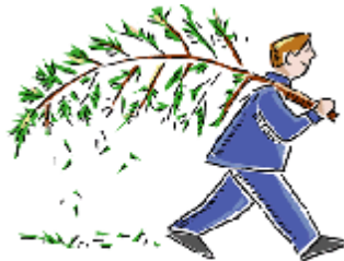
Removing of the Greens